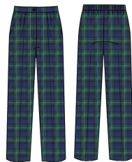
TARTAN PLEATED TROUSERS