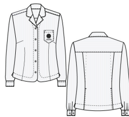
LONG SLEEVE BLOUSE