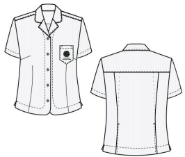
SHORT SLEEVE BLOUSE